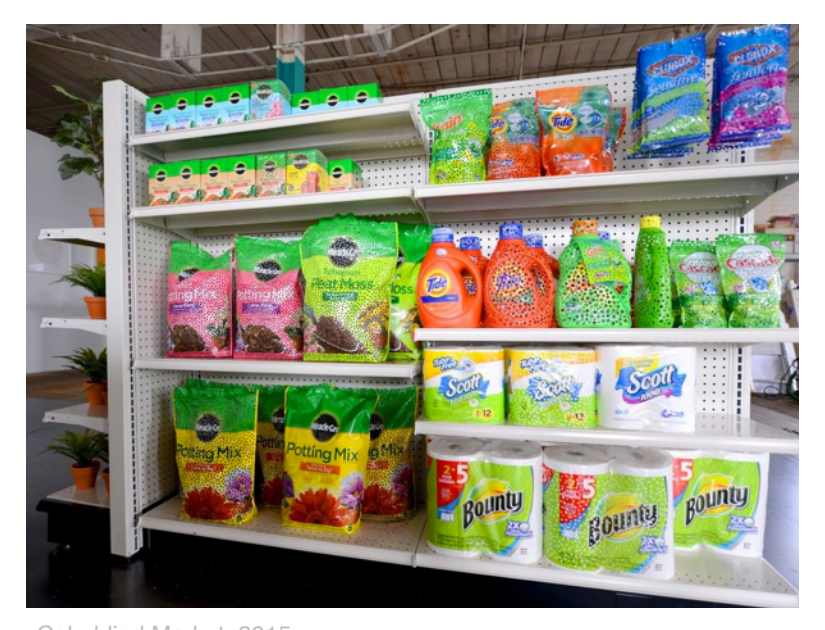
Colorblind Market, 2015 Josée Bienvenu

Much of McClure's practice involves using processes more often applied to textiles than paper. McClure has also created a series of finely woven paper objects reminiscent of wall tapestries. To create this series, the artist cut up classic comics into strips—Captain America, Wonder Woman, The Adventures of Tin-Tin—and pieced them back together, weaving alternate storylines that are barely perceptible. The show also contains an installation in the gallery's project room, Mini Market, for which the artist color-coded corporate packaging in red and green, punching tiny holes in the packaging in a reference to the Ishihara color-blind tests. Finally, the show includes several of the artist's balls of string—Jack Kerouac books cut into strips of paper and then reassembled into balls. —M. Osberg