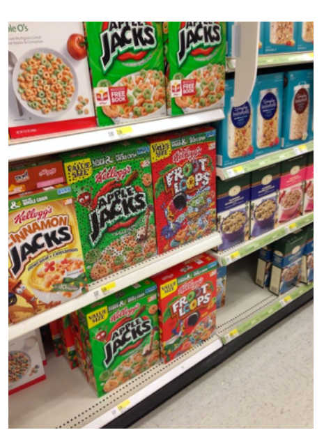
Colorblind Market, 2015 Josée Bienvenu